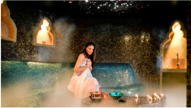
Stephanies Day Spa