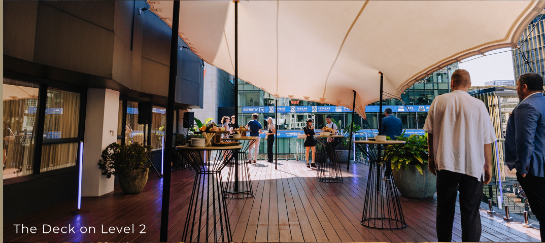
The Deck on Level 2

The Level 2 open air Deck is a versatile space, ideal for various events such as cocktail parties, wellness-gatherings, and private celebrations. The deck overlooks the Commercial Bay and Britomart areas.