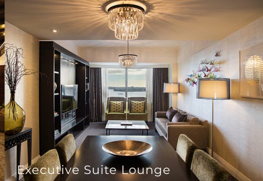
Executive Suite Lounge