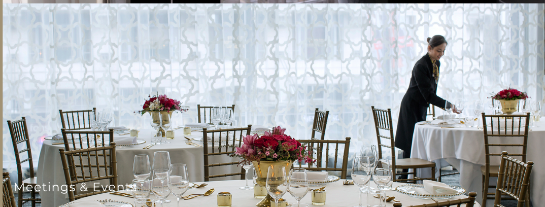
Meetings & Events