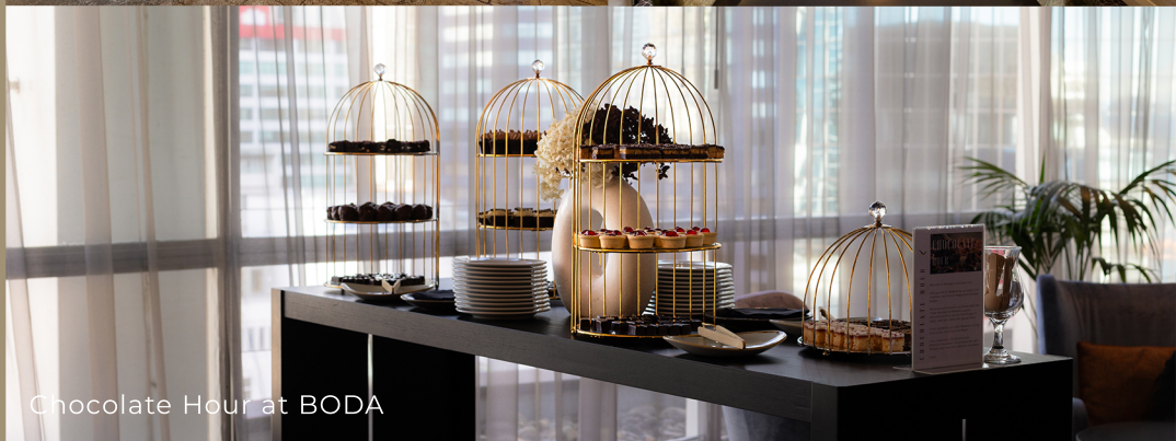
Chocolate Hour at BODA