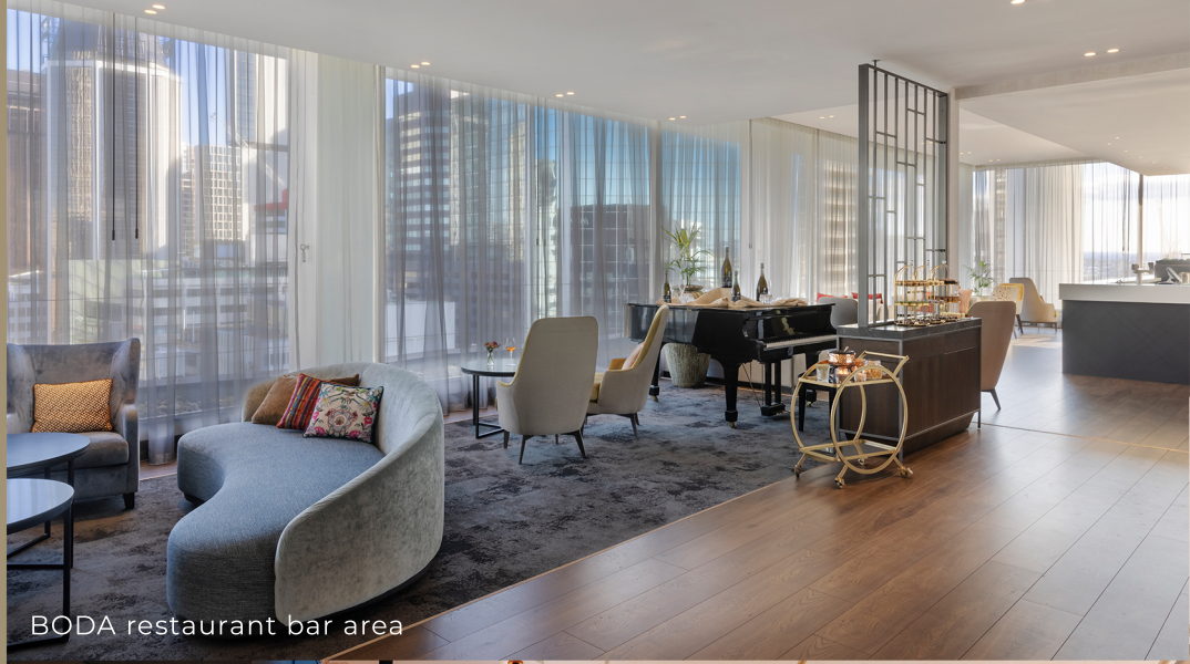
BODA restaurant bar area

BODA Restaurant sits at the top floor of the hotel, offering an expertly crafted modern Korean fusion menu, serving up vibrant, flavourful dishes paired with stunning panoramic views of Auckland's cityscape and harbour.