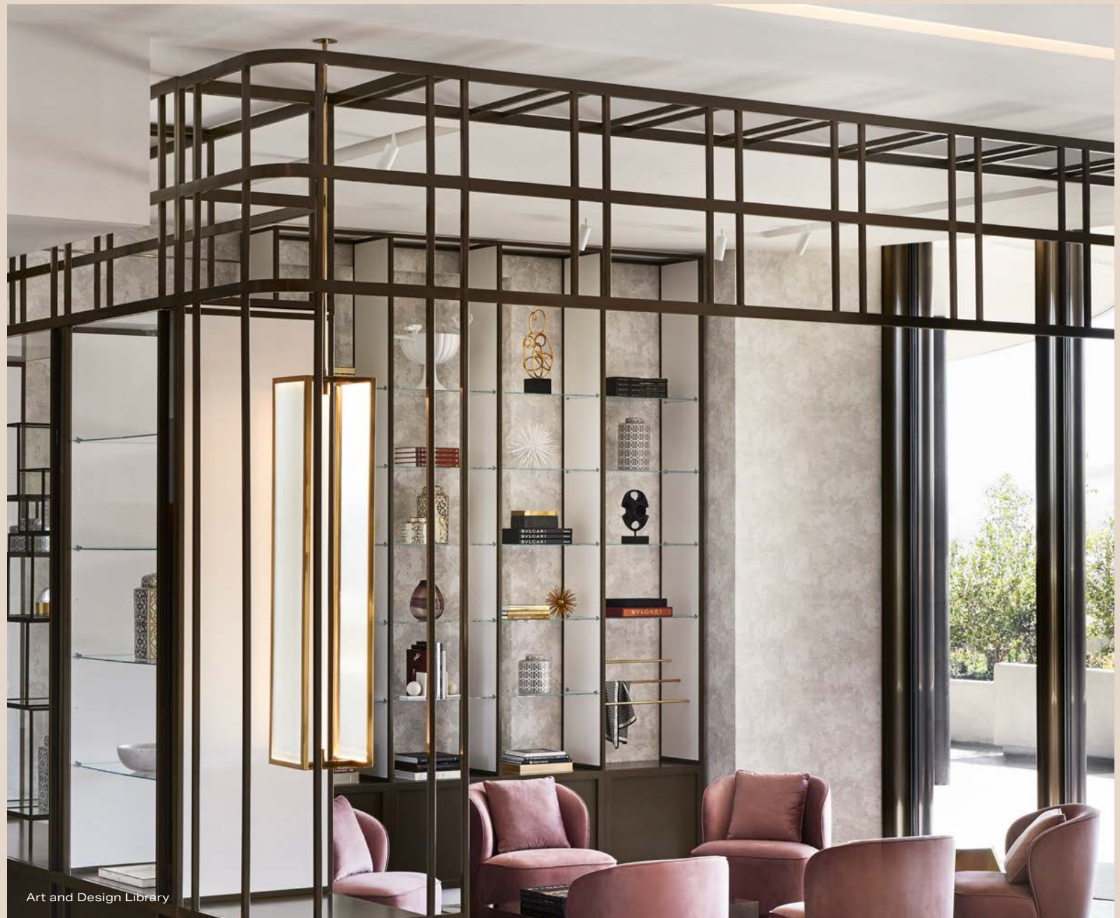
Art and Design Library