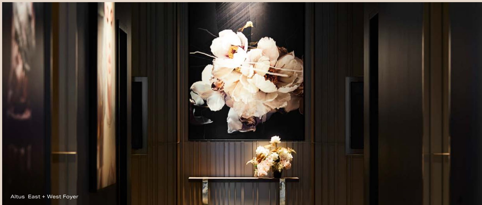
Altus East + West Foyer