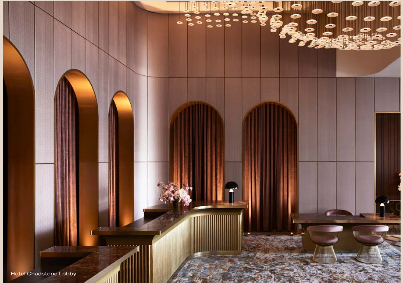
Hotel Chadstone Lobby

Offering exclusive experiences, exceptional service and boasting views of the Melbourne skyline, Port Phillip Bay and the Dandenong Ranges, this five star hotel has been built with the ultimate in guest experience in mind.