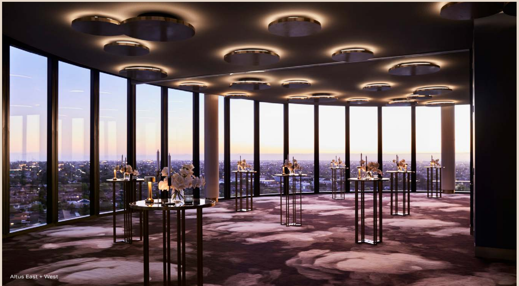
Altus East + West

Hotel Chadstone Melbourne's production is managed in-house by Audio Visual Dynamics (AVD), offering the highest quality AV services with state of the art equipment.