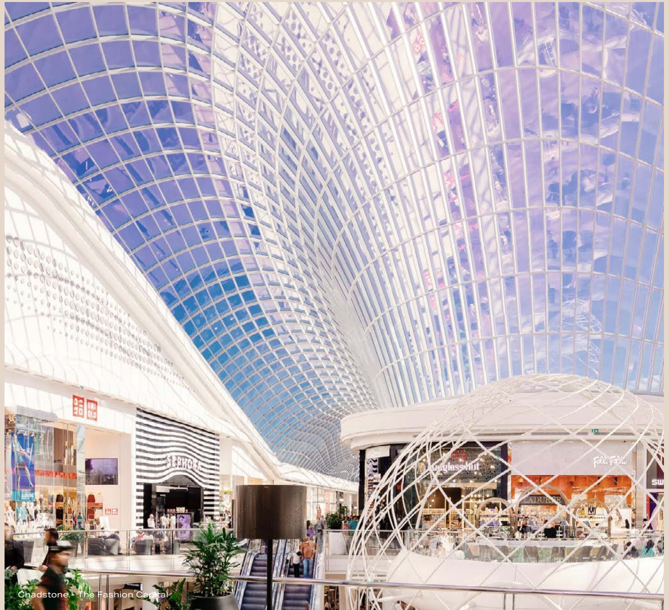
Chadstone - The Fashion Capital

Chadstone is conveniently located on the way to major tourist destinations such as Phillip Island's Penguin Parade and the Mornington Peninsula, which makes visiting easy.