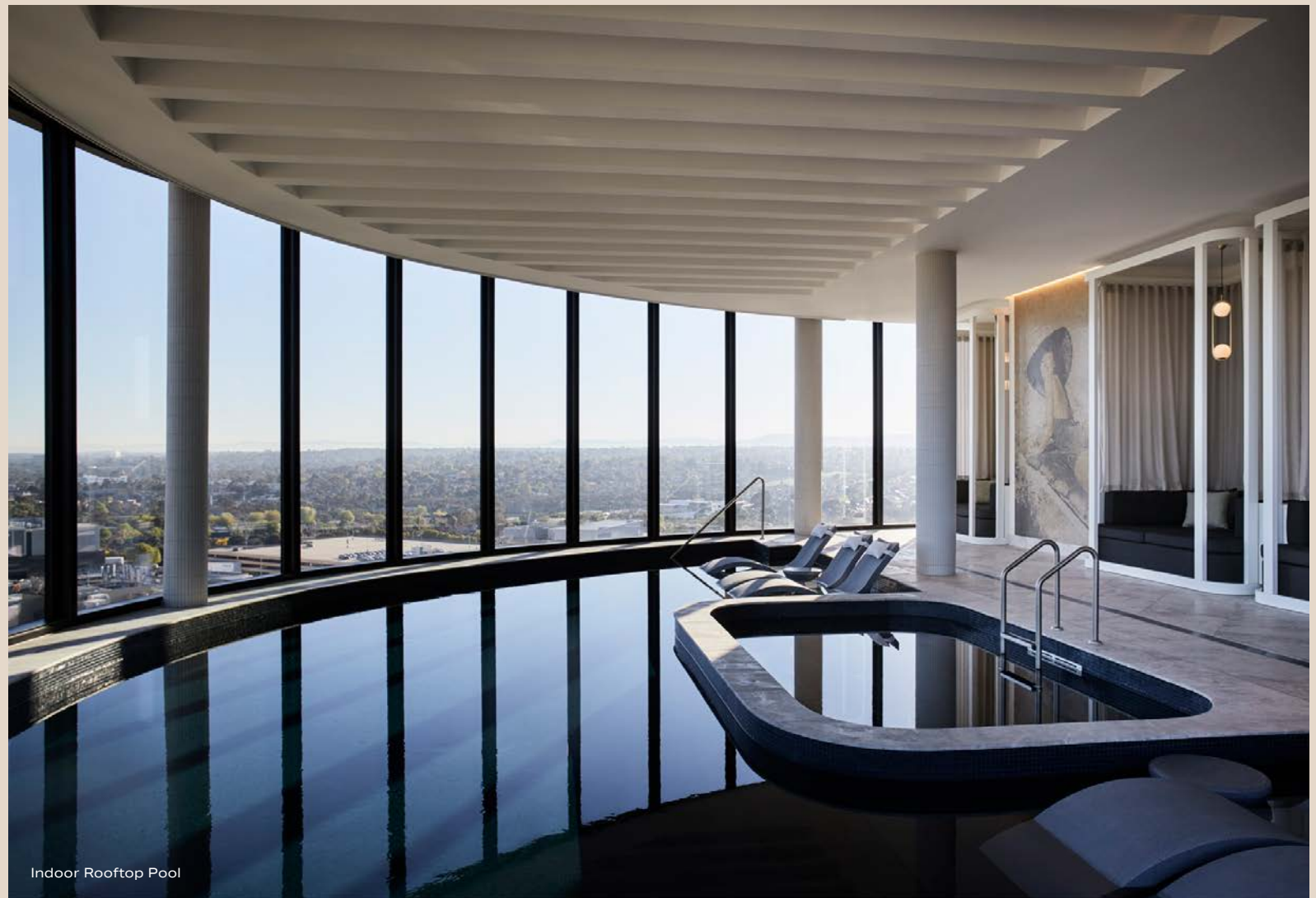
Indoor Rooftop Pool