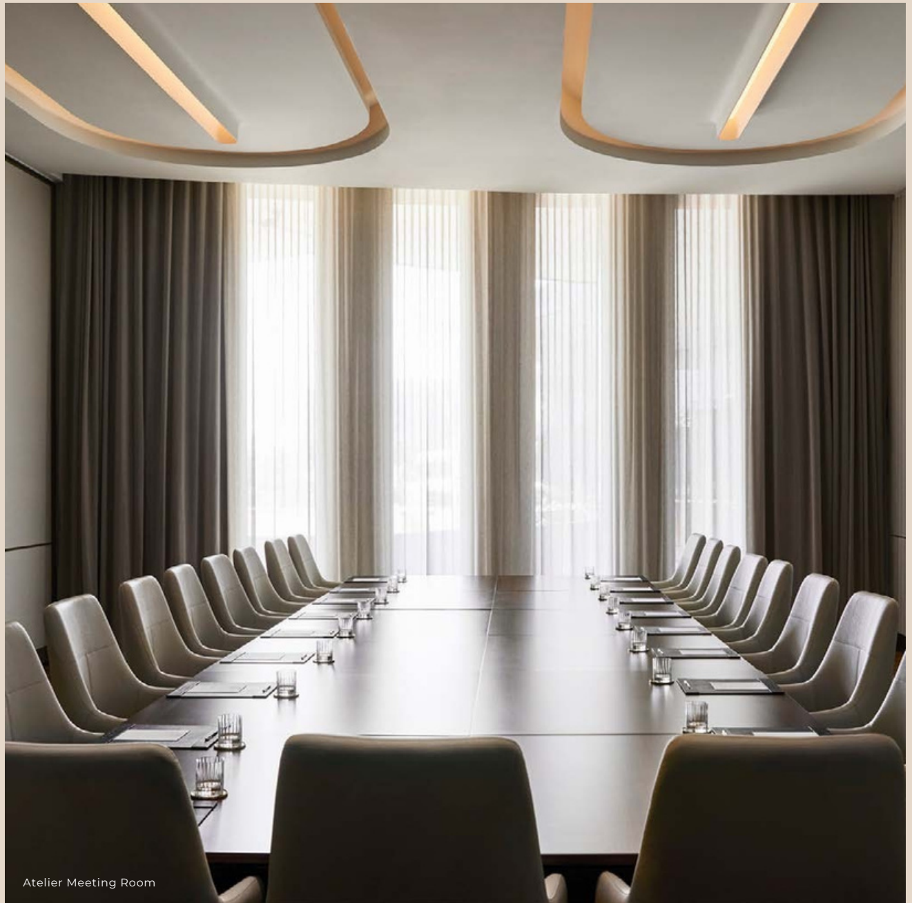
Atelier Meeting Room