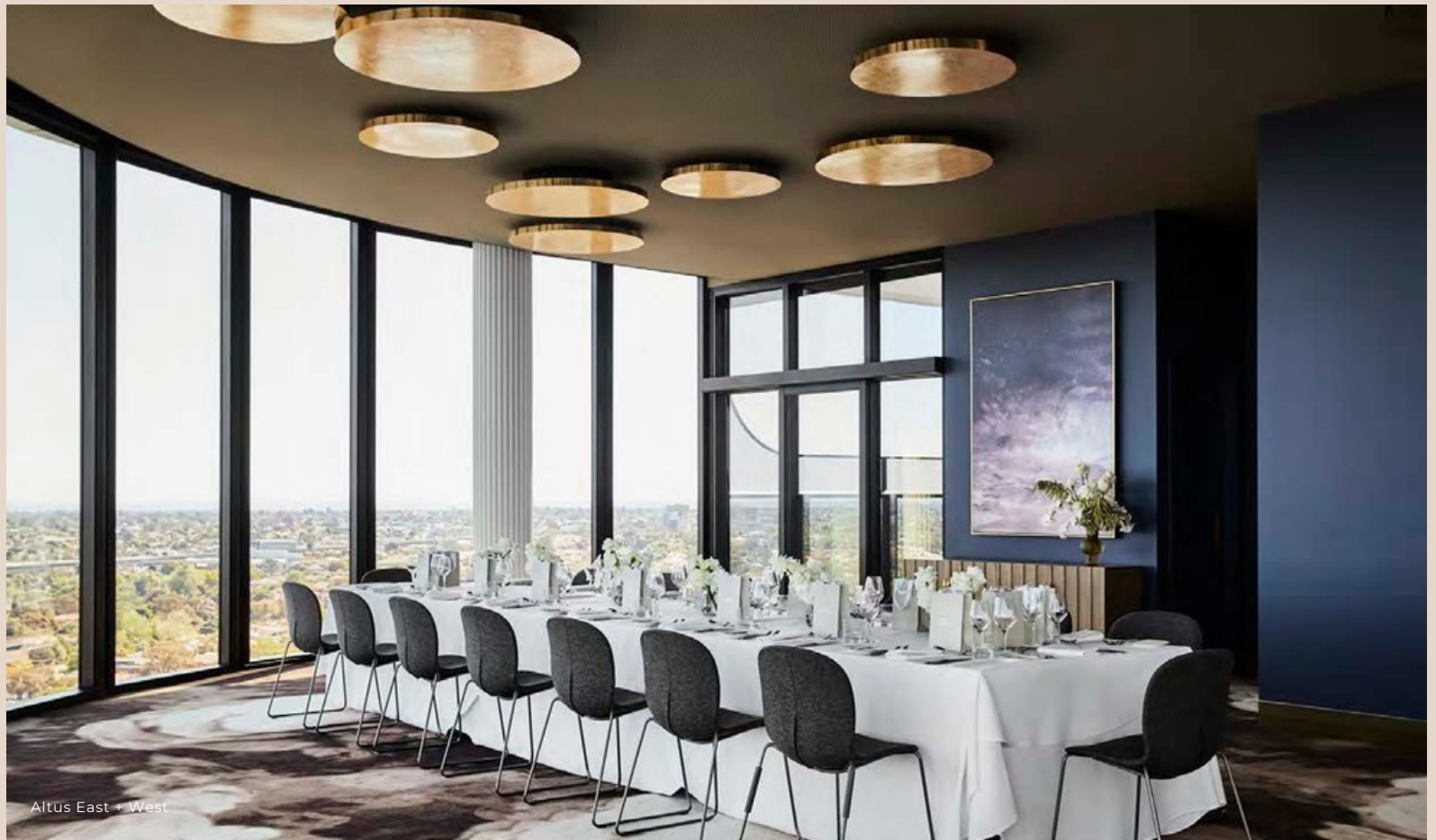
Altus East + West